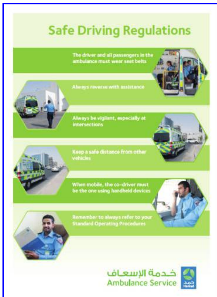
Figure.1 Poster displayed outside all ambulance stations