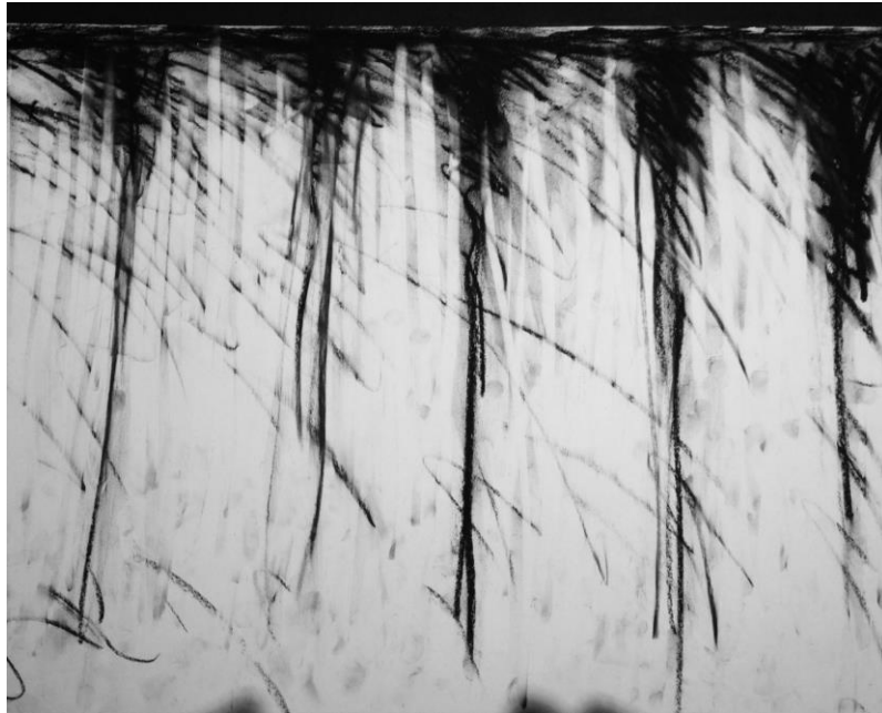
Figure 1. Response to overwhelming client defences evoking fear in the counter-transference, charcoal on paper

the relationship through an arousal of affect which was identified and elaborated on in supervision.” (transcript from research interview).