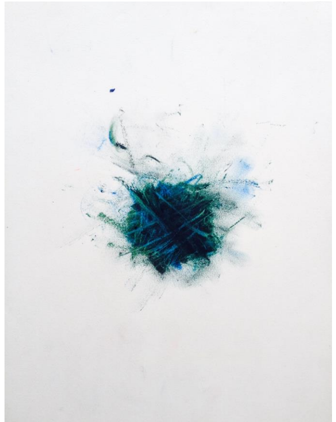
Figure 6. Holding the pain and sadness, Loss and grieving, oil pastel on paper.

Figure 6 was made following a session in which experiences of grief had been worked with sensitively, gradually working into a painful knot of conflicting feeling. This session touched the heart of the therapist as the specific loss being worked through in therapy connected with the therapist’s own experiences of loss. Holding and working with grief can be a gentle process and this image is a response to the compassion felt whilst hearing the helplessness of the client’s situation: “The grinding of the pastel into the paper produced an experience of sadness and stubbornness representing the on-going sense of holding the futility experienced when living through loss. Response art seems to help to hold the unbearable experiences disclosed by clients during my working day,” (transcript from research interview).