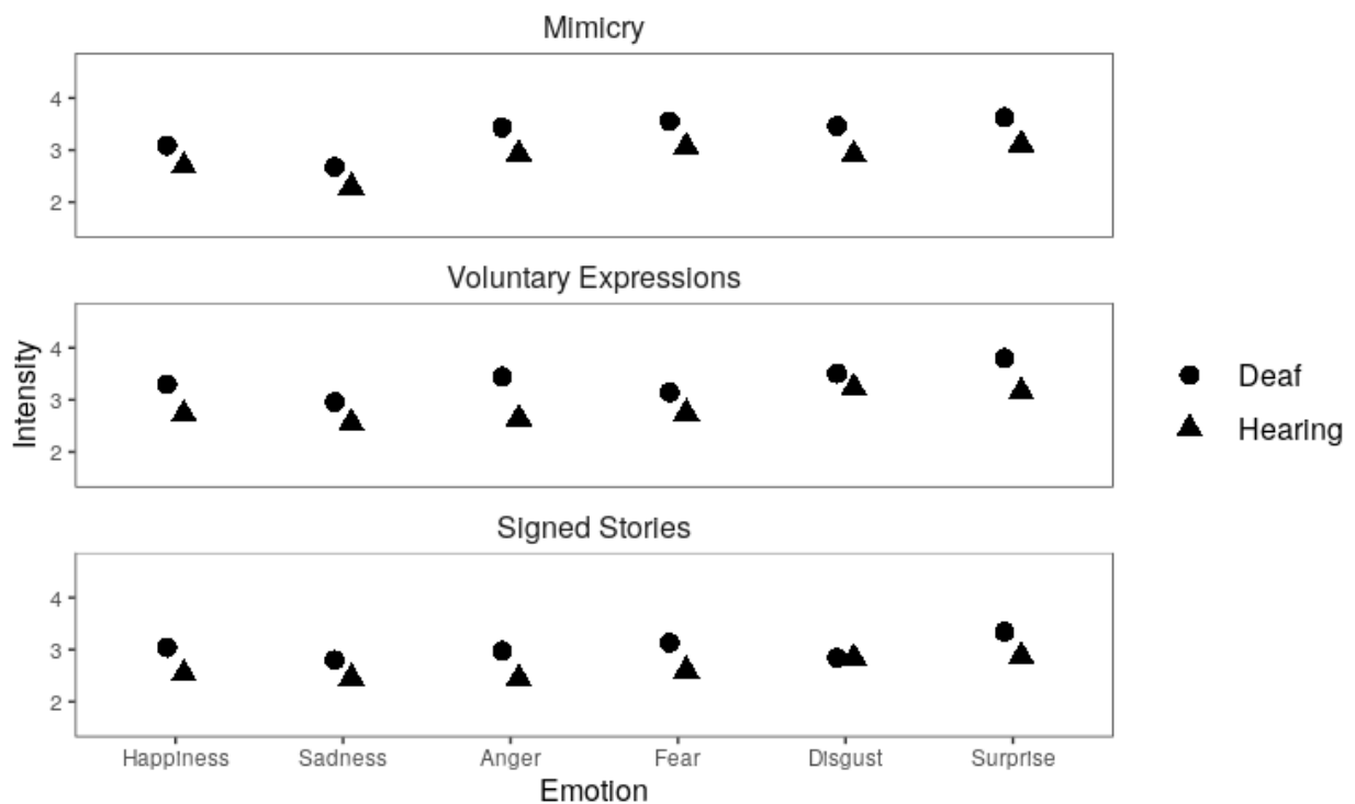
Figure 2. Adult raters intensity values of Emotions by Task by Group

revealed significant Group x Emotion interactions on signed stories and mimicry ( F(5, 340) = 8.02, p < .001 ; and F(5, 340) = 10.58, p < .001 , respectively) but not for the voluntary expressions task ( F(5, 340) = .48, p = .80 ). Separate analysis comparing each emotion between the deaf and hearing children with paired samples t -tests revealed that the expressions of deaf children were rated more intense than those of hearing children (means, standard deviations and t test results are in Table 3, Figure 2).